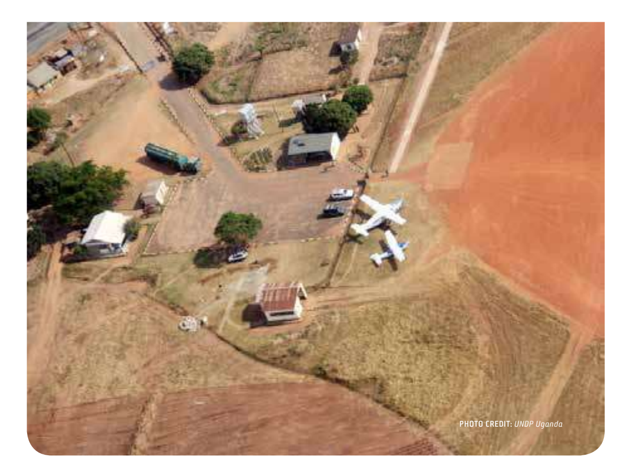
Arua Airstrip serves the Northern region with three domestic flights daily